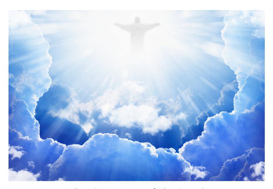
The Ascension of the Lord

Holy Cross: 12704 NE 98th Street Maxwell Iowa 50161